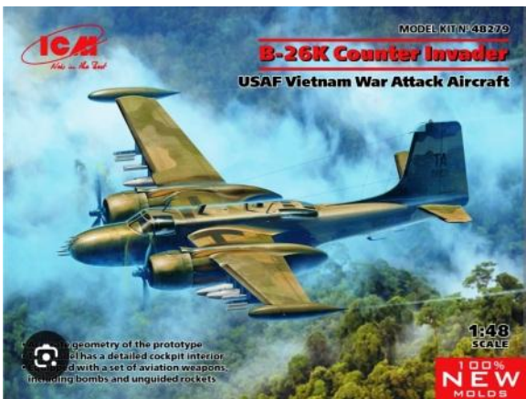
VQ Douglas A-26K 69" 40-46 twin $250