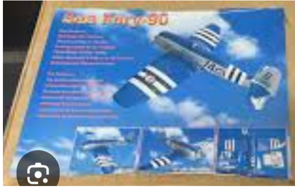
Will Hobby Sea Fury 66" 60-120 $200