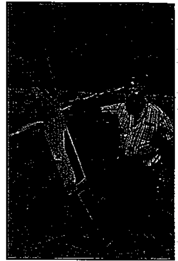
HARBOR SOARING SOCIETY

The resident, whose house backs up to Lilly Shapell Park, said the ordinance doesn't go