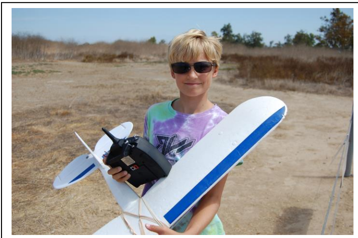
Young student pilot.

Roblee P. Askegaard, photographer and flyer Harbor Soaring Society (pictures are attached)