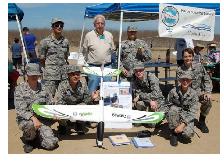
Civil Air Patrol uses Fairview Park.