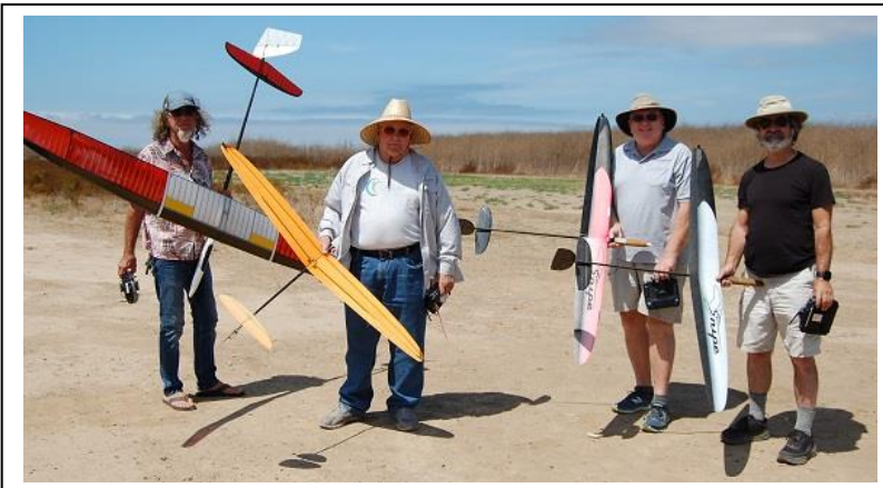
Some of our glider flyer members.