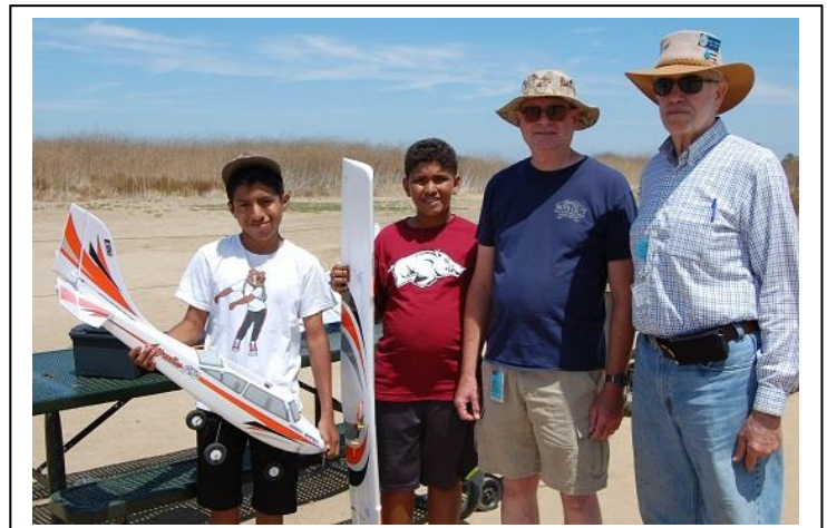
Students and flight instructors.