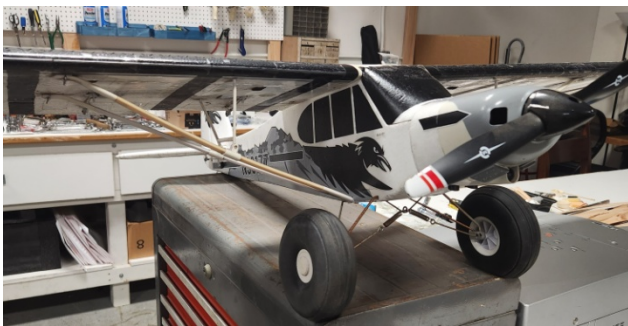
E-Flite Piper J-3 Cub

Thanks to Kevin Koch, we now have these planes available for sale: