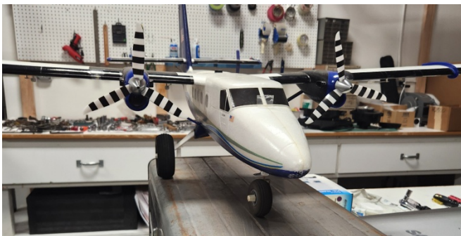
E-Flite Twin Otter w/spare fuselage