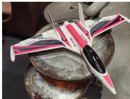
HobbyKing RadJet pusher prop