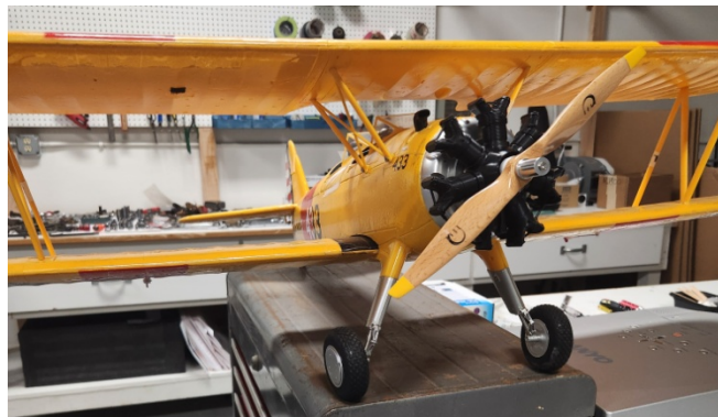
E-Flite Stearman – appears new!