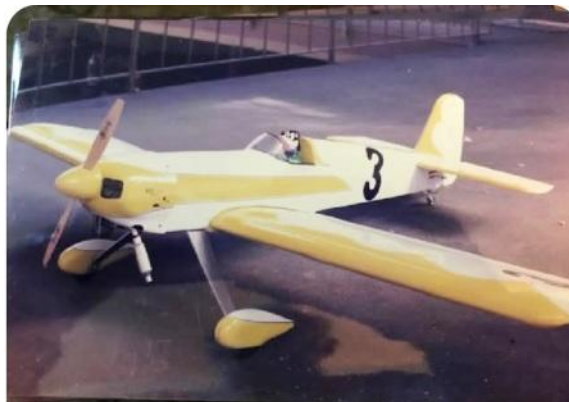
Model Tech Dragon Lady ARC 66" 60-120 $200