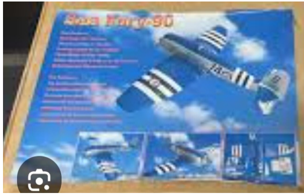
Will Hobby Sea Fury 66" 60-120 $200