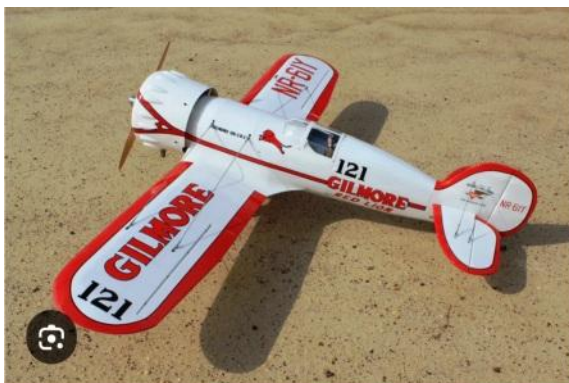
BH Models Gilmore Red Lion 58" 46-60 $200