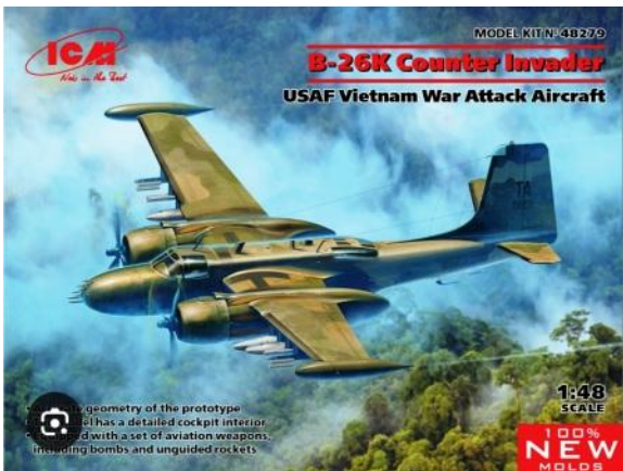
VQ Douglas A-26K 69" 40-46 twin $250