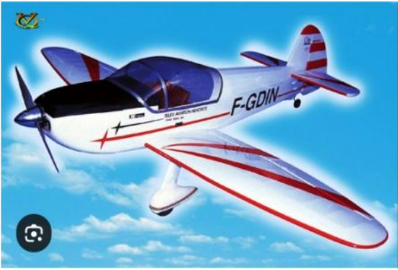
VQ Cap 10 77" 90-120 $200