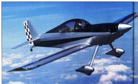
BH Models Harmon Rocket 65" 20cc gas $200