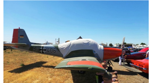
North American/Ryan Navion in disguise