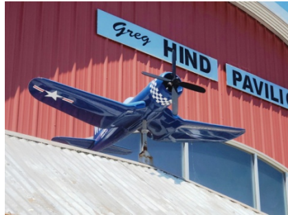
Model Corsair used as a windvane