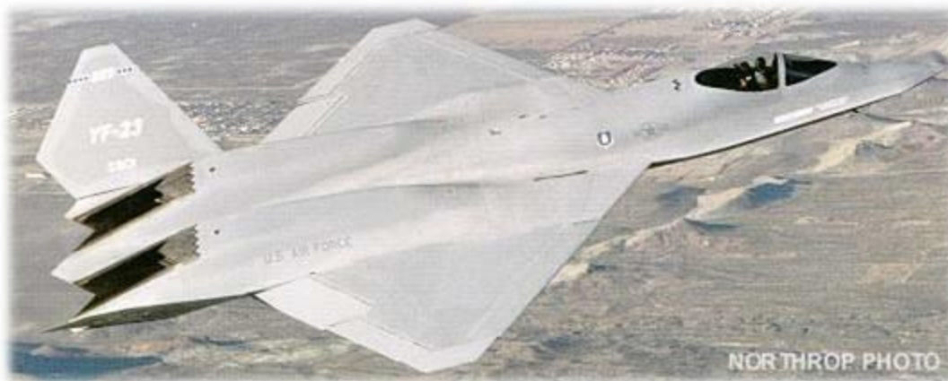
Northrop YF-23A "Black Widow II"