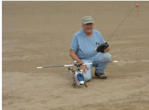
Your Prez. with Swift 550 Carbon heli. Now in need of repair!