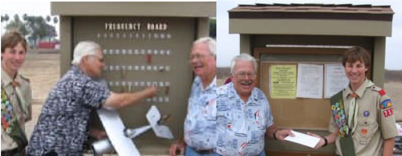
More Frequency Board photo ops