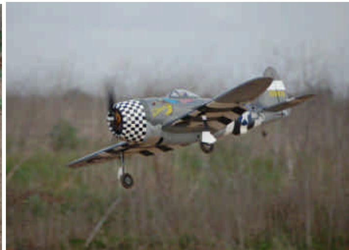
P-47 "Eileen" coming in for a landing.