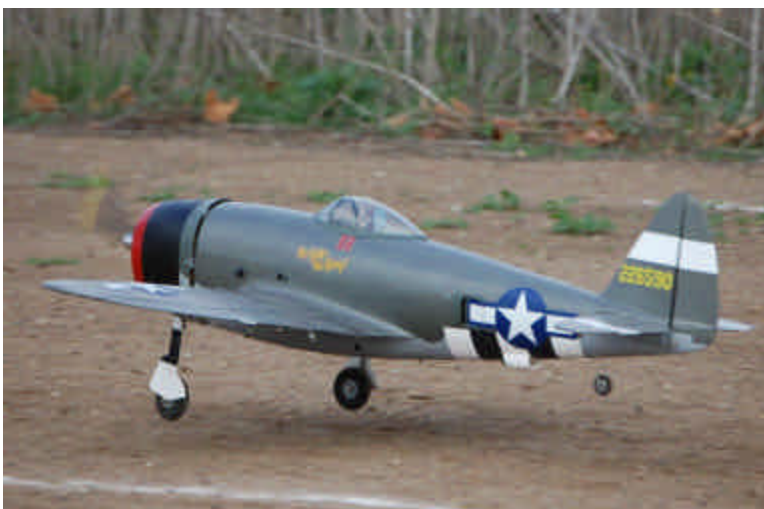
P-47 "No Guts" during takeoff.